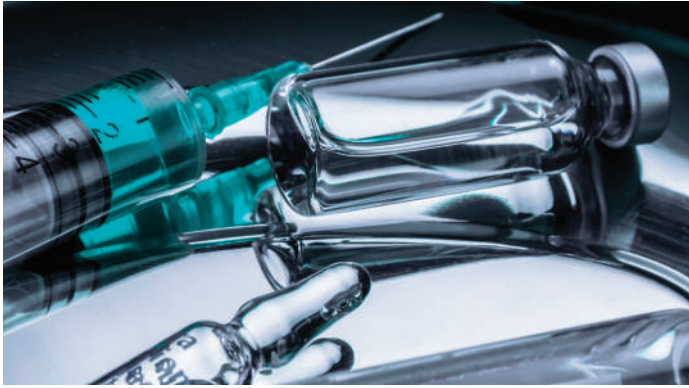
Vaccine & Pharmaceuticals