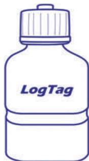
Glycol Buffer Not Included