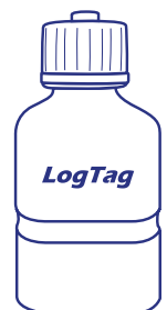
Buffer assembly Not Included