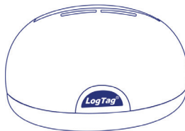
LTI-HID Not Included