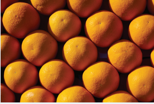
Fruits/ Vegetables/Produce distribution