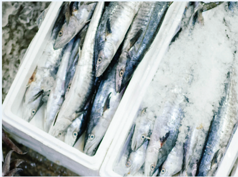
Seafood /Perishables Shipping